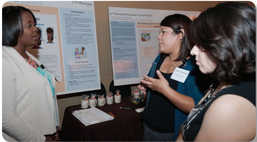
Growing Project Showcase participation.