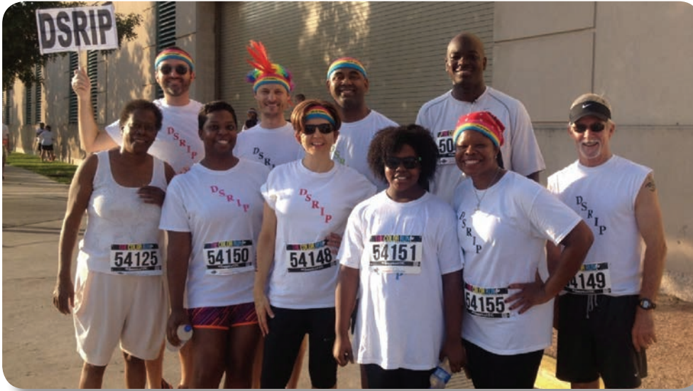
RHP3 Anchor participates in the Color Run.