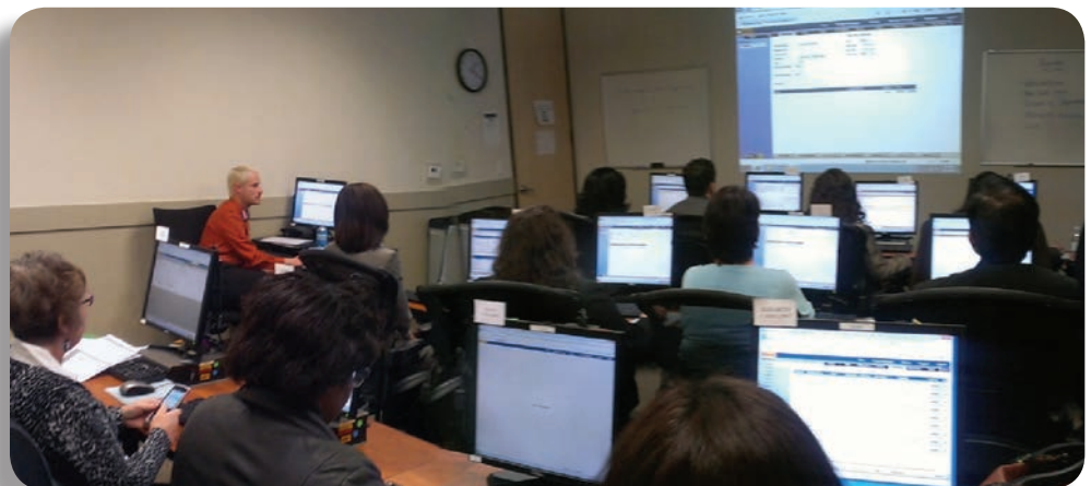
Advanced Performance Logic training.