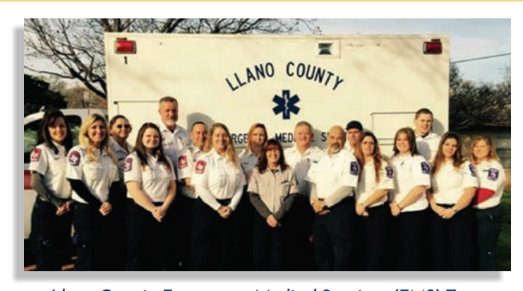
Llano County Emergency Medical Services (EMS) Team

As a continuation of RHP 8's February learning collaborative event, Baylor Scott and White Llano (BSWL) shares their best practices on their DSRIP project that is a collaboration of the local emergency medical services (EMS) and the Llano